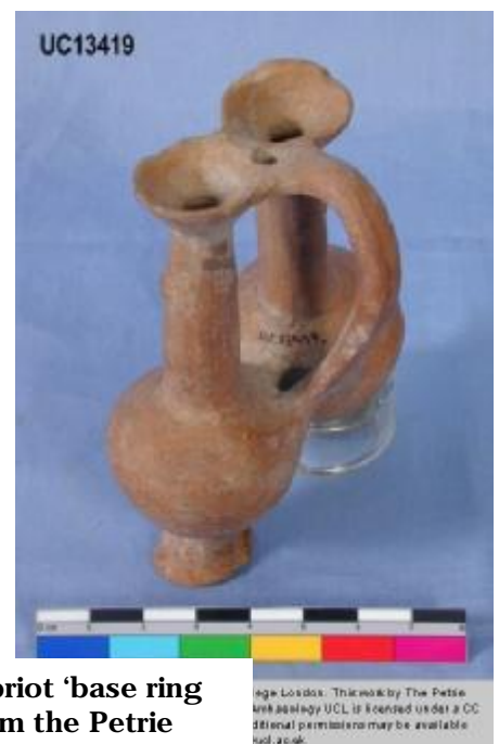
Pair of Cyprriot 'base ring juglets' from the Petrie Museum (UC13419).

I came away from the conference with a new appreciation of exactly how clichéd the Egyptians' presentation of their own 'foreign relations' really are. Through our repeated exposure to, and interest in, ancient Egyptian written sources we tend to absorb this elite Egyptian worldview. But the archaeological and scientific evidence reveals an ancient world as removed from elite and monumental textual cliché, as ours is from the over-used tropes of Hollywood. In contrast to the Egyptian cliché of the desert as a dangerous and frightening 'other', satellite imagery reveals