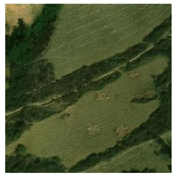
Fig 1: High resolution 100x100m satellite image tile of Peruvian terraces, from the Global Xplorer crowd-sourcing platform.

(http://www.cancerresearchuk.org/support-us/citizen-science/the-projects) and astronomers have been using members of the public to classify galaxies, speeding up analysis of telescopic data (https://www.galaxyzoo.org).